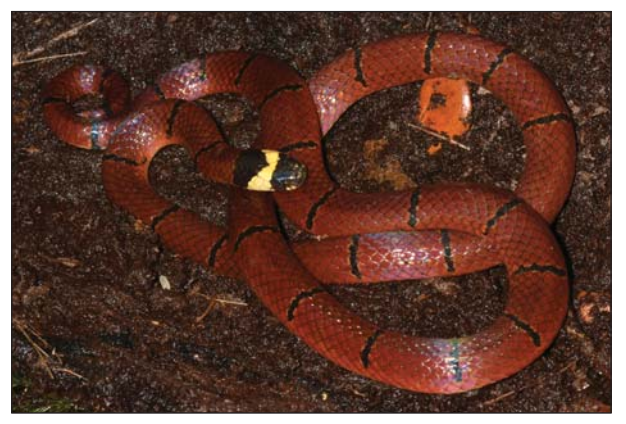
Fig. 3 Sinomicrurus macclellandi (CBC 02885) in Bokor National Park, Kampot Province, southern Cambodia.