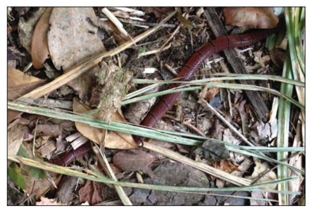
Fig. 4 Sinomicrurus macclellandi (not vouchered) in Bokor National Park, Kampot Province, southern Cambodia.