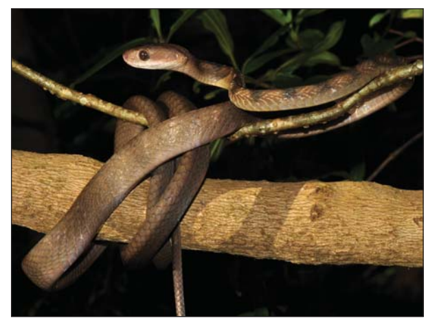
Fig. 2 Boiga guangxiensis (CBC 02791) in Keo Seima Wildlife Sanctuary, Mondulkiri Province, eastern Cambodia.