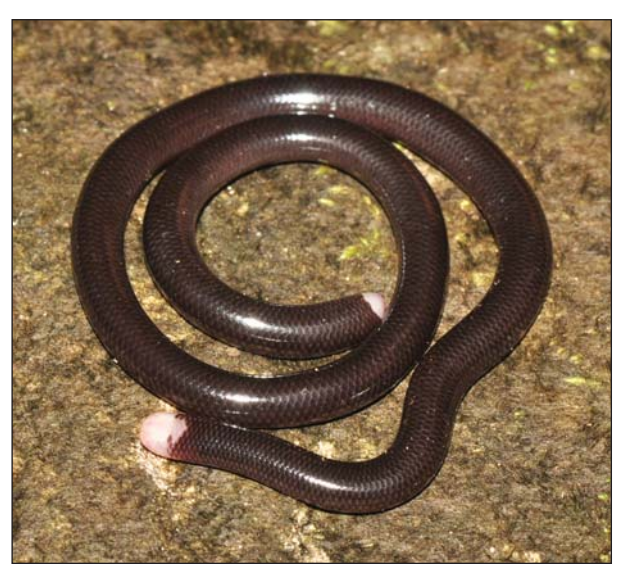
Fig. 5 Indotyphlops albiceps (CBC 02861) in Bokor National Park, Kampot Province, southern Cambodia.

yellowish-cream transverse band behind eye; indistinct scattered yellowish cream spotting anterior to eye, on internasals, and prefrontals; and ventral surface cream with black blotches. Photographs taken in February 2016 reveal a snake with a slim, cylindrical, red body, with regular transverse thin black bands, and a black head with a large cream band. Although the snake is partially obscured in the photographs, these characteristics are sufficient to confidently assign the individual to this species (Taylor, 1965).